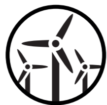
Very High Wind Upgrade Kit

For full details of our Coastal Upgrade Option, refer to www.duratuf.co.nz/duratuf-warranty .