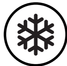
Snow Load Upgrade Kit